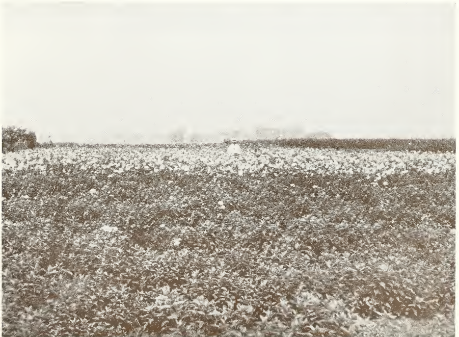
Block of Hydrangea paniculata grandiflora , two to three feet.